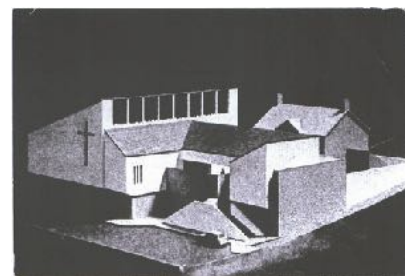
original vision for the church in 1970